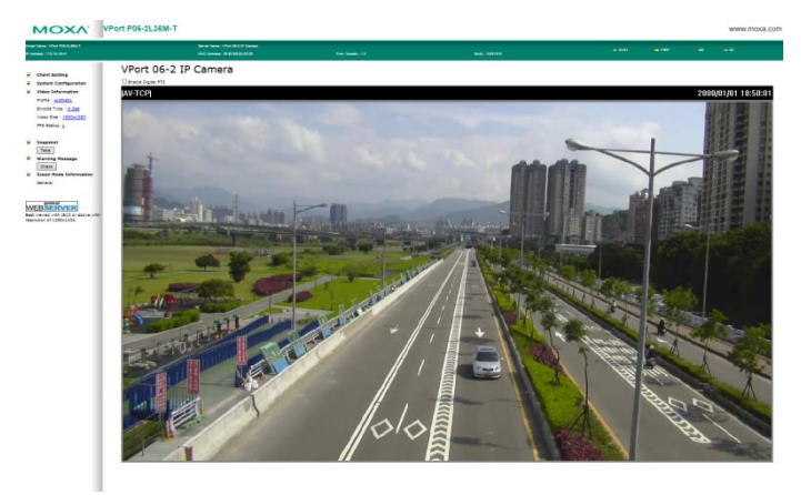
Step 5: Access the VPort's system configuration.

Click on System Configuration to access the overview of the system configuration to change the configuration. Model Name , Server Name , IP Address , MAC Address , and Firmware Version appear on the green bar near the top of the page. Use this information to check the system information and installation.